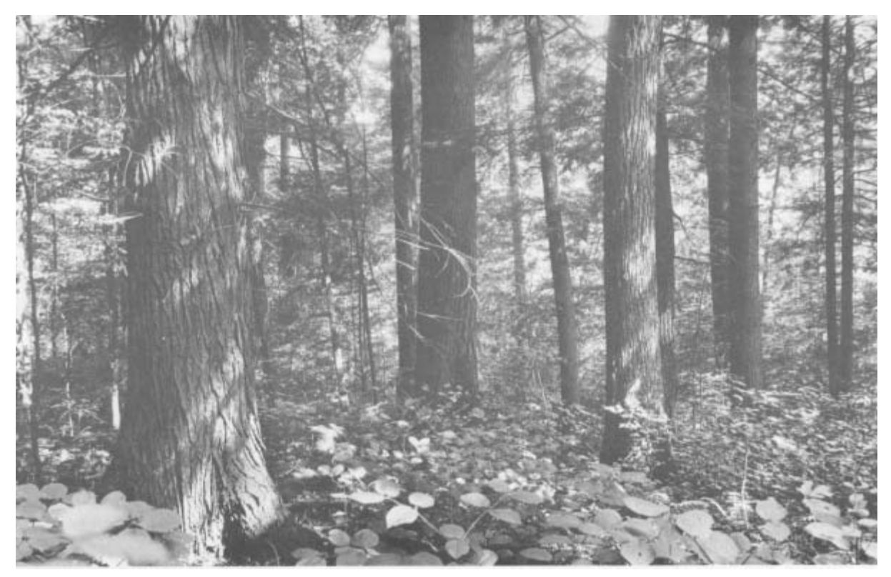
FIGURE 2.—Typical bark of mature, thrifty hemlock.