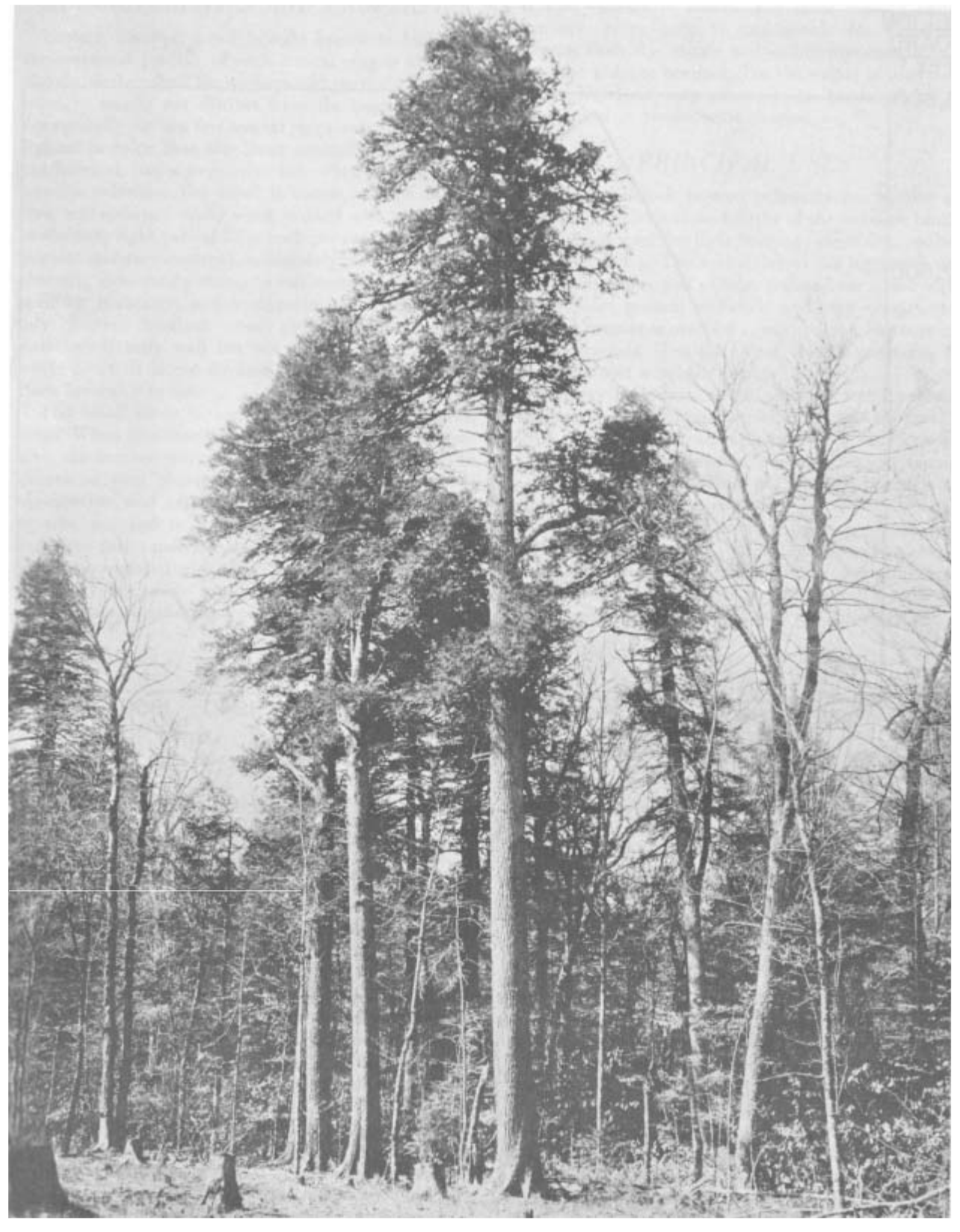
{\bf Figure\,4.} {\bf -Old\,mature\,eastern\,hemlock\,tree\,with\,ragged\,crown.}