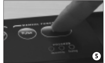
Press Seal Button