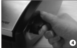
Close and Latch Lid