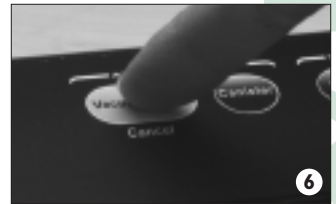
Press Vacuum & Seal Button