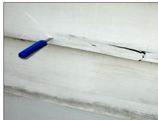
Figure 1. The decay shown in this yellow-poplar siding on a new construction started about six years after installation.

Until the early part of the 20th century, yellow-poplar ( Liriodendron tulipifera L.) was used extensively throughout its range (the Mid-Atlantic, Mid-South, and Midwest) for exterior and interior