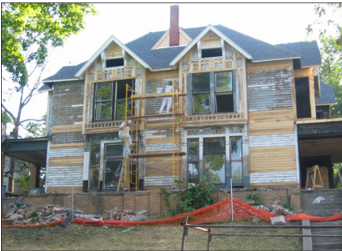
Figure 3. This 1880s Midwestern house originally used yellow-poplar for siding and architectural adornment. Restorers replaced about one-third of the siding with a mix of yellow-poplar sapwood and heartwood.

As we enter the 21st century, those high-quality old-growth sources of redwood, cypress, and western red cedar lumber are in short supply and costly. Much of today's redwood, cypress, and western red cedar lumber is coming from second- or third-growth stands that contain substantial amounts of white sapwood, making them susceptible to decay and insects. In the mean time, however, the yellow-poplar resource has recovered and plentiful supplies of relatively inexpensive lumber are available. And because yellow-poplar was once an excellent species for exterior millwork, many individuals are again using it in those applications.