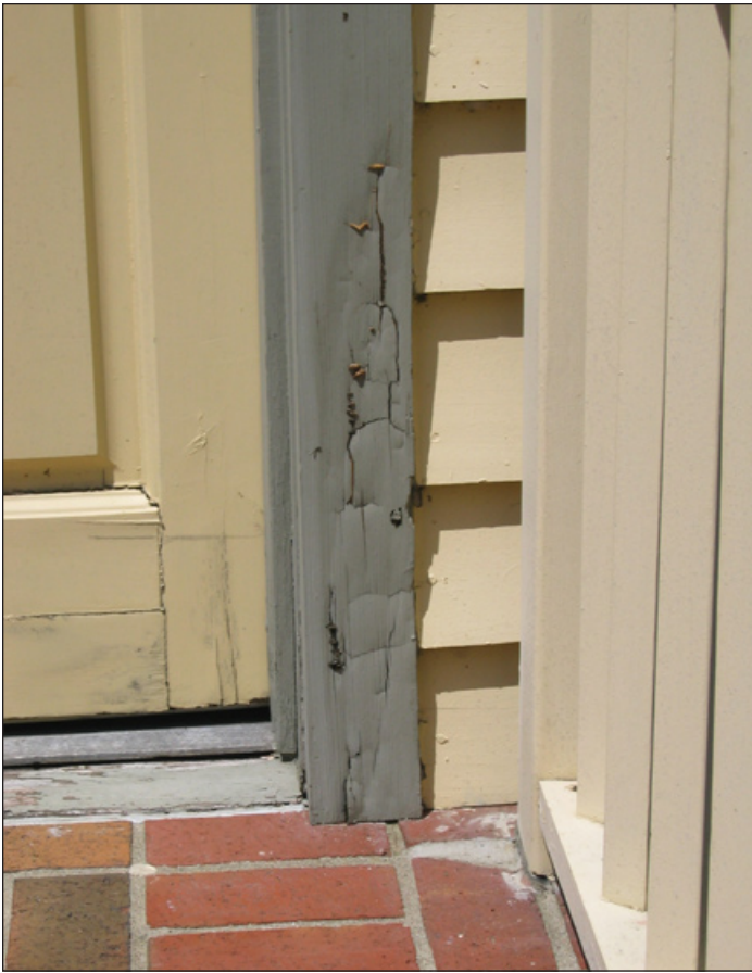
Figure 2. This residence in Historic New Harmony, Indiana, has deteriorating yellow-poplar.