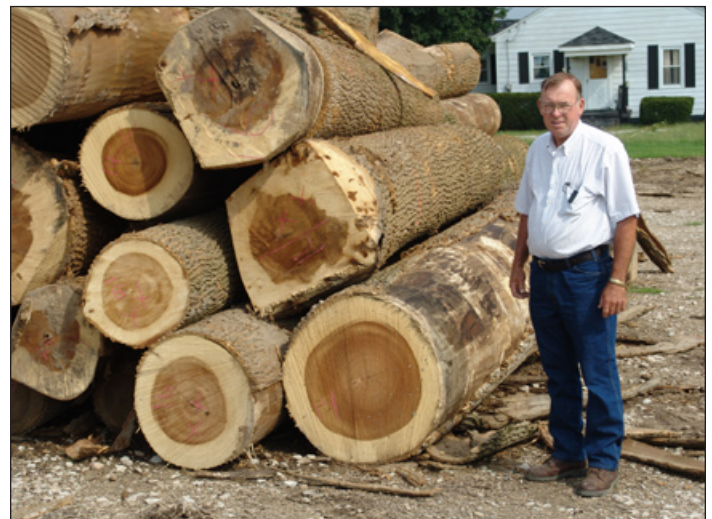
Figure 4. These yellow-poplar logs show a wide sapwood band and brown heartwood. Logs of this excellent size and quality are commonly available.

In terms of its availability and properties, yellow-poplar is a very viable resource when compared to the traditional western softwoods, including Ponderosa and Jeffrey pines. See Table 1 for a comparison of lumber prices.